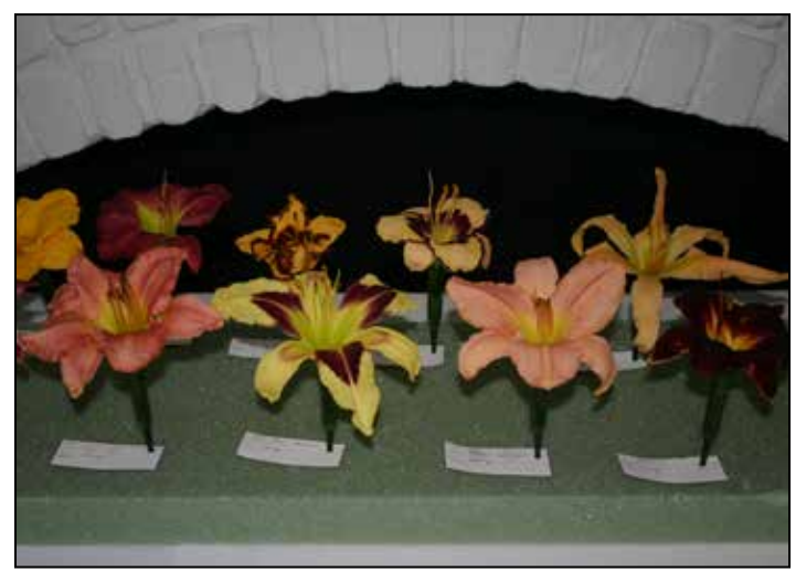
As part of the Columbus Daylily Festival held June 7-8, 2014, on the day following the Chattahoochee Valley Daylily Show, the Club held an informal show also open to the general public. The display featured several on-scape exhibits, but consisted largely of off-scape flowers like those pictured above. The show included miniatures, small flowers, large and extra large flowers, doubles, polymerous forms, spiders, and unusual forms. So that each attendee could feel a part of the festivities, during both shows, the public was encouraged to vote on "People's Choice" awards. Both the formal and the informal show were held in a recently renovated 1890's farmhouse which had been relocated to the site of the Columbus Botanical Garden.