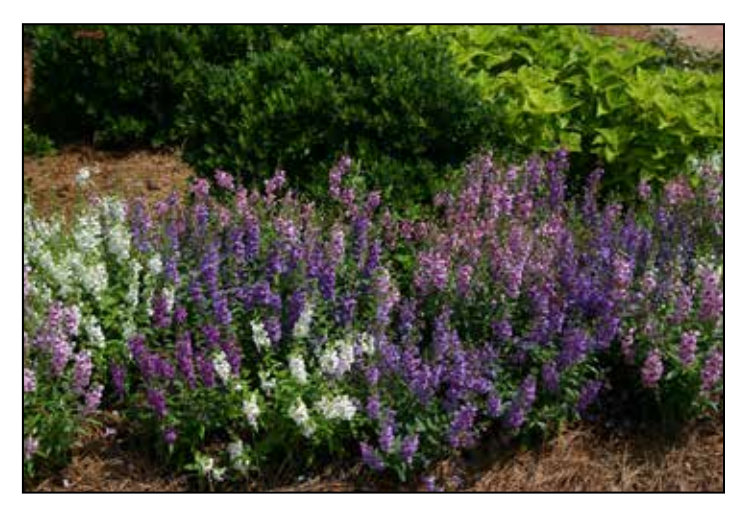
Beds of angelonia, planted near the farmhouse, were at peak bloom during the Festival. This annual makes a great companion plant for daylilies and other perennials.

The formal daylily show was held on Saturday in the historic 1890's Adams family farmhouse that has been renovated and relocated to its current Botanical Garden site on Weems Road. An informal show, also open to the public, was held on Sunday.