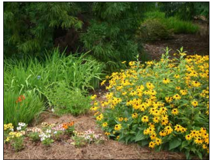
Numerous beds of annuals and perennials were in colorful array during the Festival. Rudbeckia fulgida var. sullivanti 'Goldsturm' (Black-eyed Susan or Orange coneflower) glowed against varied shades of green.