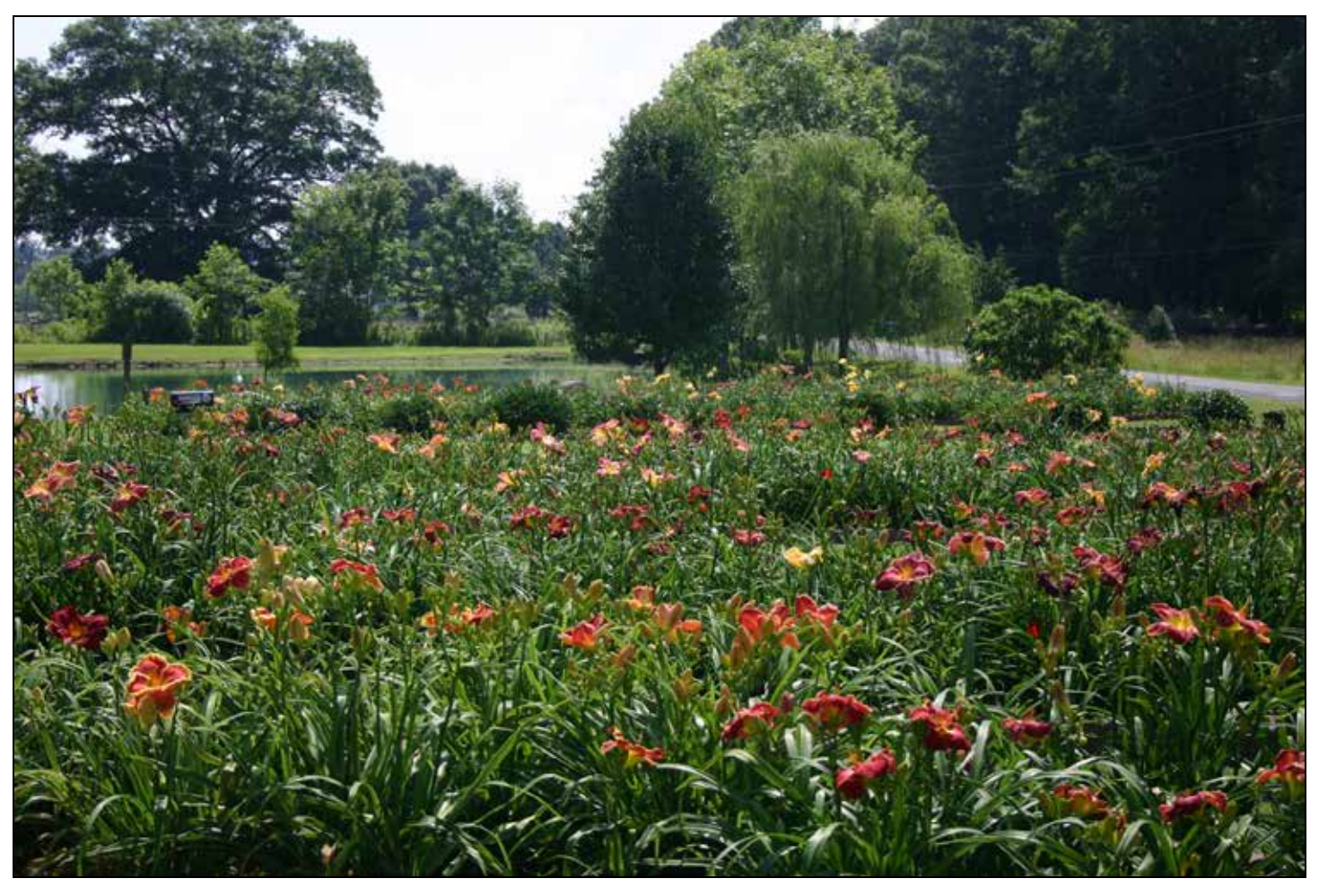
The Brazelton Garden offered a fantastic display of daylilies, including hundreds of seedlings grown in a beautifully landscaped setting. Above, a small portion of Jim's red seedlings showed to advantage.