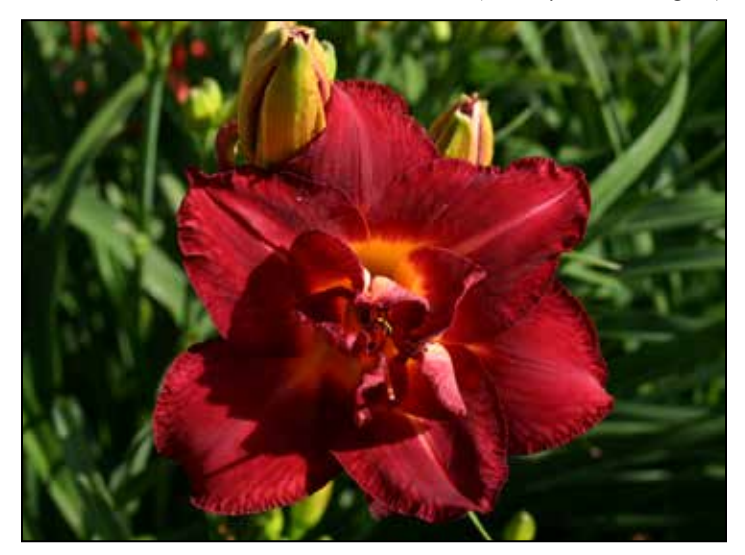
Hemerocallis 'Double Blue Blood' (George-T. 2005) was outstanding at Bella Vista and captured the Shelton Holliday Award for the best clump of a registered double daylily as seen in a tour garden.