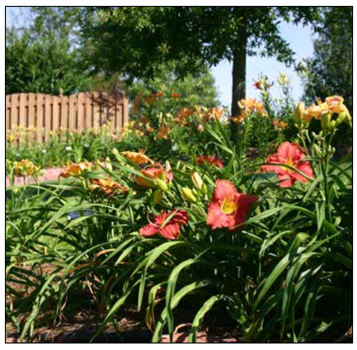
Among the older daylilies featured at E-Scape was H. 'Red Step Ahead' (Carpenter-J. 2005).