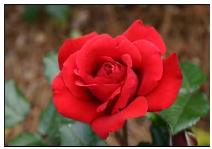
Although your editor was not able to go on the trip with fellow M.A.D.S. members, he was able to travel down to Hattiesburg on April 27 and stop by the rose garden on the campus of the University of Southern Mississippi. The roses, including Rosa 'Crimson Bouquet' pictured above, were at peak bloom. Below is a shot of the Golden Eagle which the group from Montgomery much admired.

After grabbing the redneck raincoats once again, M.A.D.S. members hopped on the bus and headed north to Hattiesburg. The group had a little down time before being "forced" to eat again at the Movie Star Buffet. (We really enjoyed eating our way through two states.) The buffet building alone is worth a visit, but the food was great, also. Once we were all too stuffed to move, we headed out for some much needed exercise: walking the grounds of the Lake Terrace Convention Center to see daylily beds in bloom and then on to the University of Southern Mississip-