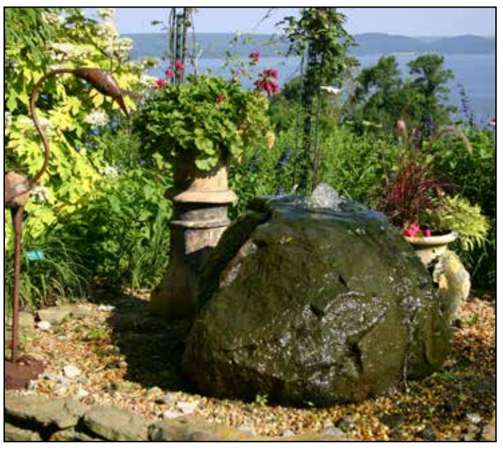
A large bubbling rock adds character to the garden. A modernistic sculpture of a crane contemplates a drink, while potted plants of varying textures and colors add charm. From this strategic location, one gains a lovely view of Guntersville Lake.