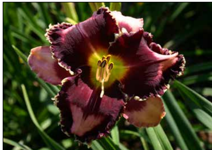
H. 'Fabulous Black Pearl' (Salter 2008) was very sultry as seen blooming at Bella Vista.

The next area of interest was a courtyard garden room to the right of the drive. This small garden was formed by the gap between house and a garage. Here pink to lavender blue hydrangeas and clumps of miniature daylilies, many introduced by Grace Stamile, Pauline Henry, and Elizabeth Salter, form the walls of the room. Mary has flanked the grassy path lined with blue ageratum, a particularly effective companion plant for daylilies. The path leads to two white rockers on a small porch. These invite visitors to rest and look at Mary's use of plants to paint a beautiful Matisse-like setting.