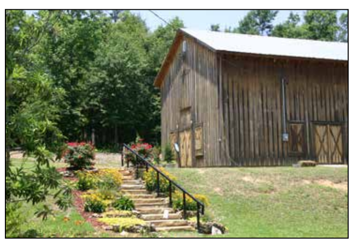
Steps, topped with Knockout roses, rise from the lower garden up to the start of the Holt Walking Trail and the old Gin House, where the speakers gave their presentations.