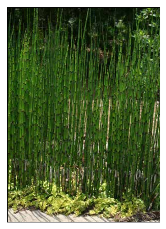
This translucent bamboo-like plant sprouted from a bed of creeping jenny. Both seemed mildly invasive, but were nonetheless striking.