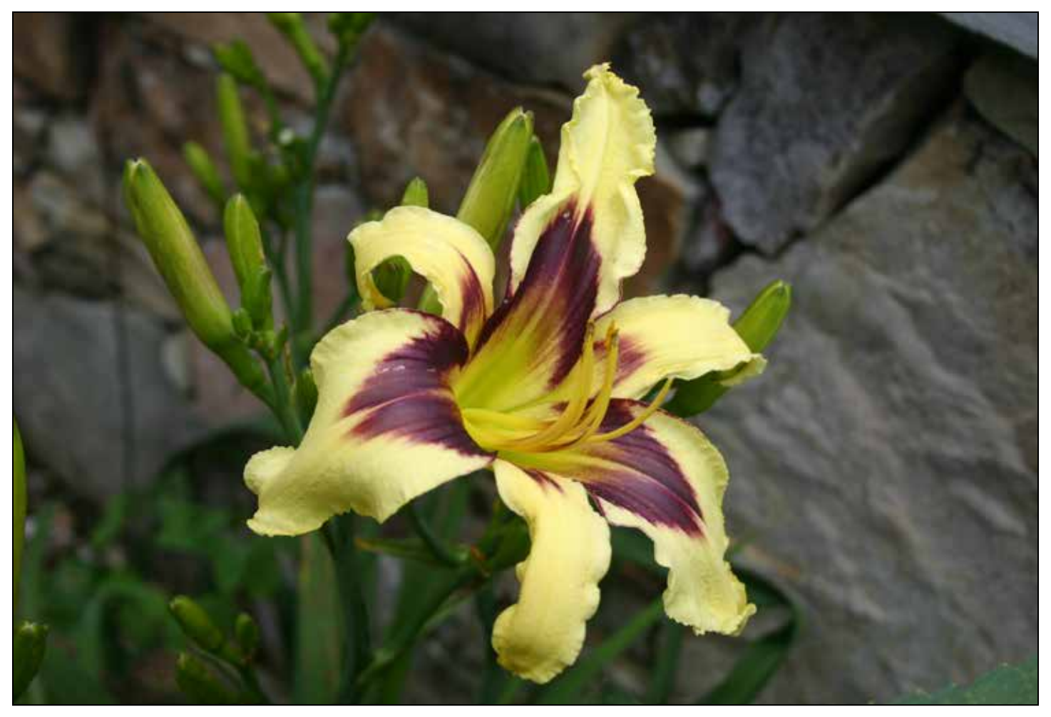
Again, the stone made an effective backdrop for photography in the Hooper Garden. H. 'Eye of Truth' (Gossard 2011), an unusual form cascade, showed off its beautiful yellow blooms, each with a maroon eye.