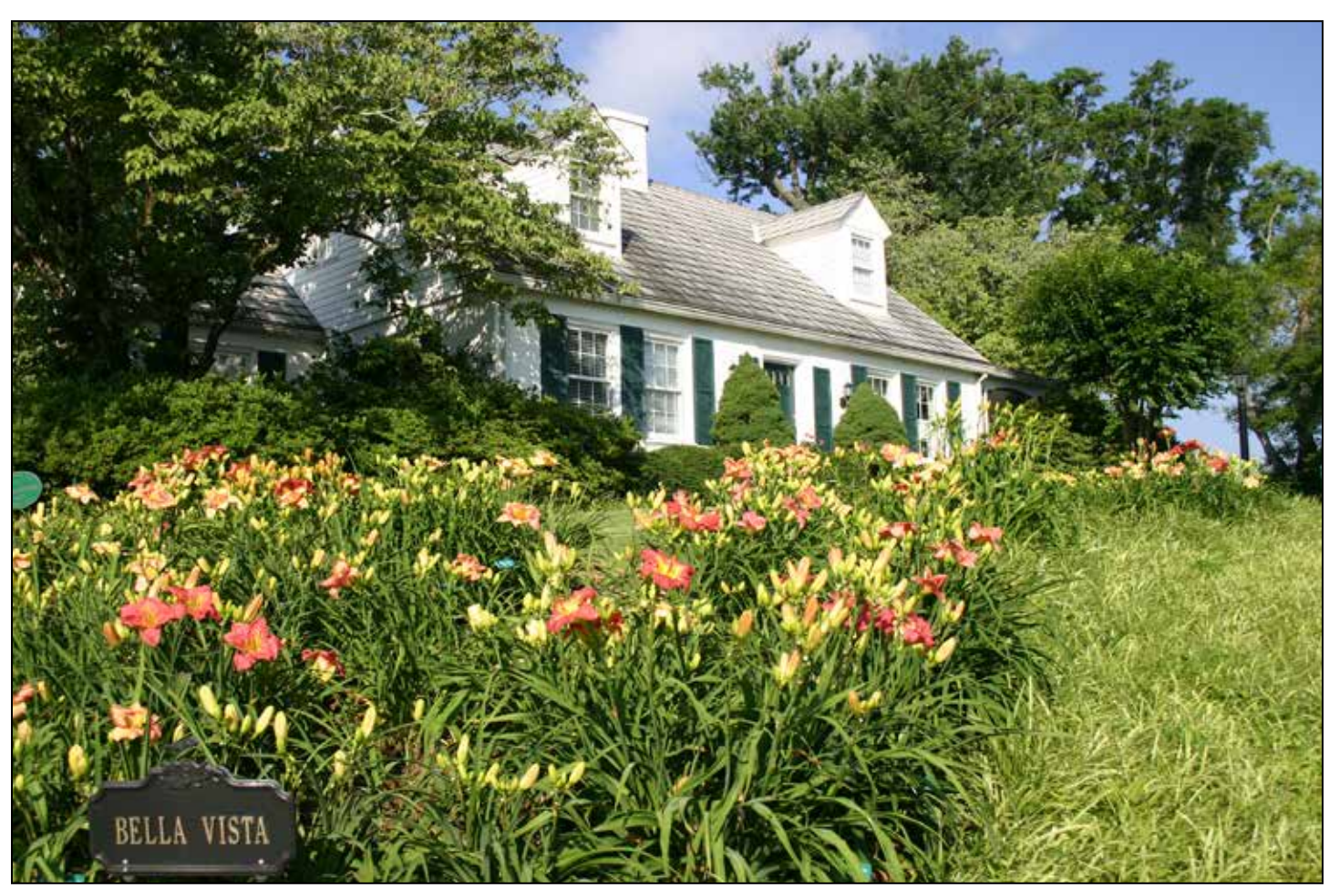
A colorful array of daylilies greets the visitor as one approaches the front of Mary Terrell's home, situated on a bluff overlooking Guntersville Lake.

I joined the daylily enthusiasts, many with camera in hand, going from clump to clump exclaiming over their favorites or trying to find just the right angle from which to shoot the perfect bloom portrait. Other eye-catching cultivars included 'Juicy Ripe Peach' (Bell 2011), 'Fabulous Black Pearl' (Salter 2008), and 'Camden Gold Dollar'