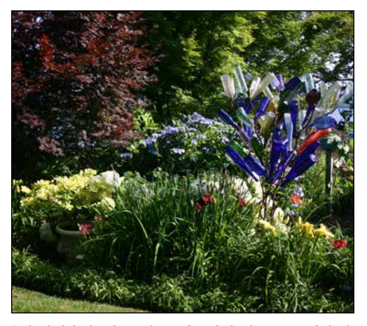
In the shady backyard, Mary has configured a lovely specimen of a bottle tree. The Japanese red maple, red daylilies, white and blue hydrangeas, and a occasional blue iris still flowering complement the colors of the bottles.