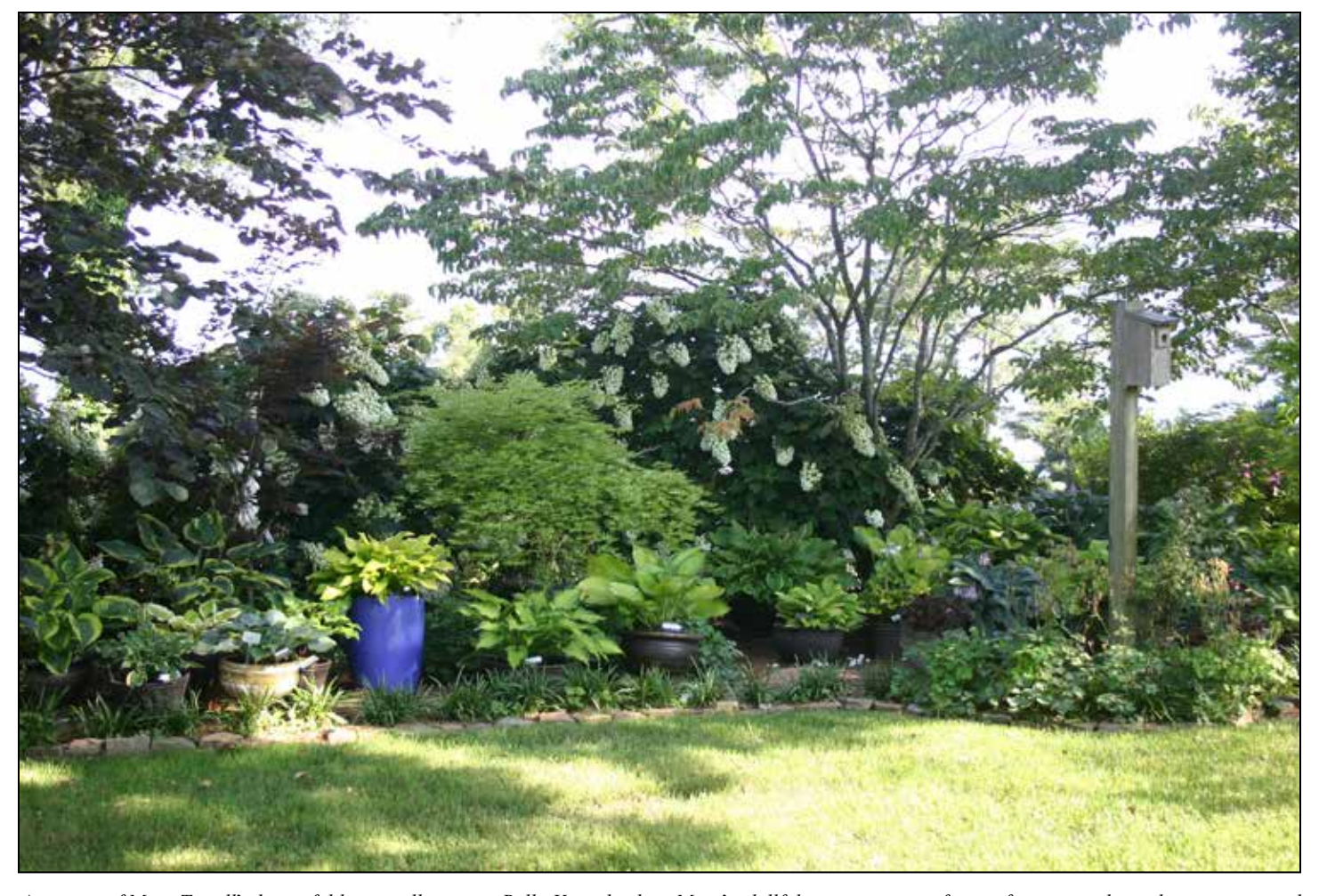
A portion of Mary Terrell's beautiful hosta collection at Bella Vista displays Mary's skillful incorporation of pots of various colors, shapes, sizes, and textures to enhance a landscape. Bella Vista won the Region 14 Landscape Award for the best use of daylilies in landscaping a tour garden.