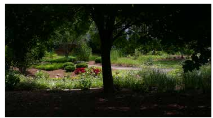
The lower garden contains an impressive planting of annuals, perennials, and shrubs to delight the visitor.