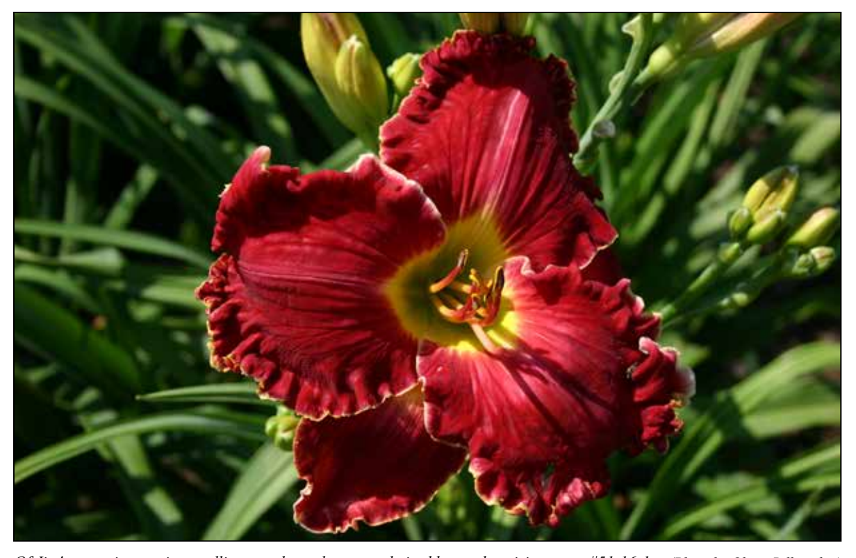
Of Jim's many impressive seedlings, perhaps the most admired by garden visitors was #51-16-1.