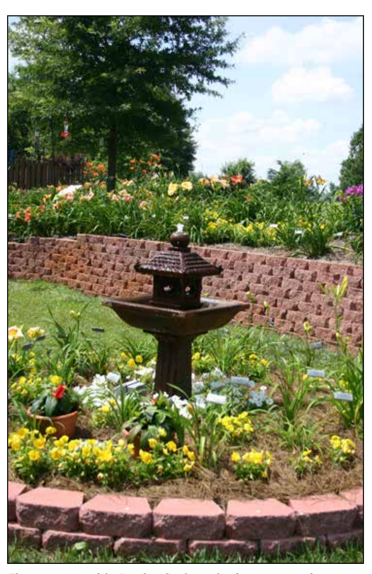
The centerpiece of the Beecher Garden is this fountain water feature surrounded by delicate flowers. Terraced with raised brick walls, the backyard presents any array of daylilies, many at eye-level. In the bed just beyond the water feature, two huge blooms of the cultivar, H. 'Forgiven' (Bell 2013) were admired by many visitors.

The entry to the back yard is through an arch made from a wooden trellis with a real metal headboard and footboard on either side of the "flower bed" trellis! From that clever and amusing entrance point, the garden is an intense sea of color wandering up the back slope. The Beecher's collection of approximately 350 healthy cultivars includes a nice blend of some gorgeous plants that are not the usual suspects in the garden, and some others that are all-time favorites. Since the Beecher's back yard is steep, when they designed their garden, they terraced it with raised brick walls, putting these flowering beauties at almost eye level. And what a treat that the blooms are at nose level too! How awesome! To add more interest to the garden, their landscaping includes an assortment of potted plants, a charming spitting ceramic frog, and a fountain water feature dedicated to their daughter. The entire garden is a beautiful work of art and creativity.