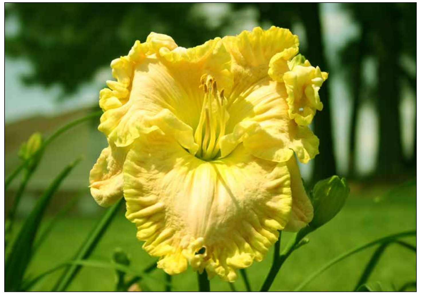
The Beecher Garden contained many cultivars recently registered. One of the most impressive in your editor's opinion was Tim Bell's Hemerocallis 'Forgiven' (2012). This huge yellow daylily with a light pink blush drew a lot of attention.