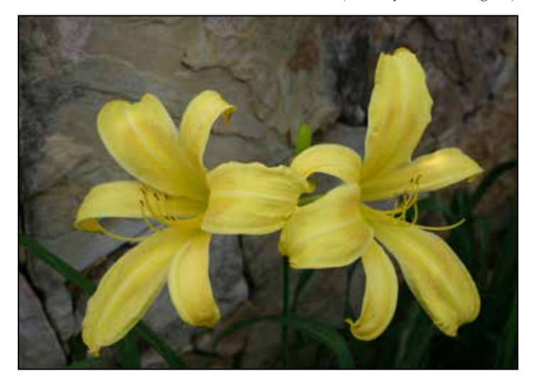
Hemerocallis 'Forced Impulse' (Peat 2002) was a favorite of several visitors to Stone Wall Garden. Framed against one of the walls, it made a photogenic subject.