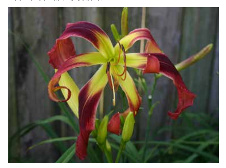
Hemerocallis 'Cherry Swizzler' (Stamile 2008) was among the many spider and/or unusual form daylilies blooming at Bella Vista. A tetraploid, it is registered as an unusual form crispate with a spider ratio of 6.18:1.

(Yancey-C. 1982). Unusual form specimen included 'Cherry Swizzler' (Stamile 2008). This area, devoted to beds featuring daylilies, gave much to admire and photograph. I constantly heard cries of "Did you see this clump?" or "Come look at this double!"