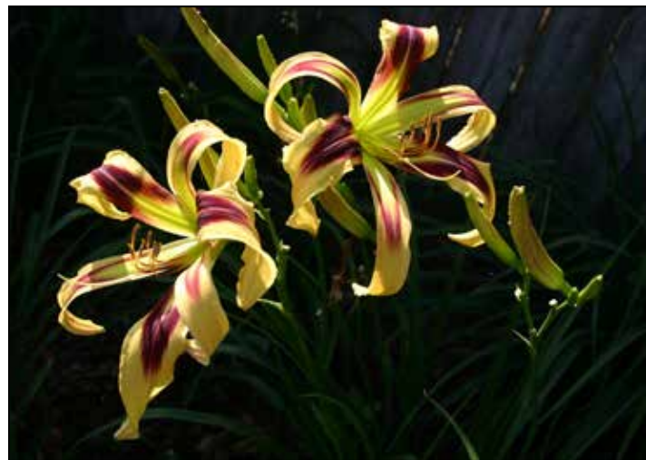
Morning light afforded excellent opportunities for photography at Bella Vista. This shot of H. 'Free Wheelin'' (Stamile 2004) was taken against the shadow of a wood fence at the edge of Mary's garden.