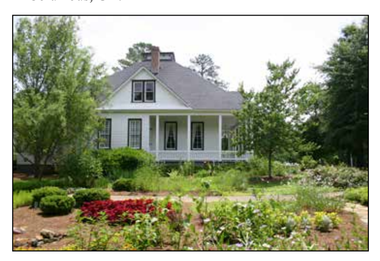
Located on the grounds of the Columbus Botanical Garden, the Adams Family Farmhouse provides a beautiful and very comfortable setting for special events. In early June, it was the location for the twenty-seventh annual Daylily Show, sponsored by the Chattahoochee Valley Daylily Society.

The Chattahoochee Valley Daylily Society in conjunction with the Columbus Botanical Garden and the University of Georgia Cooperative Extension held their first Daylily Festival, June 7-8, 2014, at the Columbus Botanical Garden in Columbus, GA.