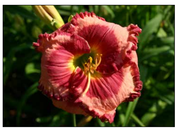
H. 'Debbie Daniels' (George-J. 2009) was particularly choice as captured blooming at Bella Vista. It is registered as a 5" pink with hot pink eye and edge.