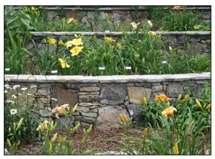
Above is a view of several of the stone walls that characterize the Hooper Garden.

It was afternoon when we arrived at the "Stone Wall Garden" of Roger and Cherry Hooper near the community of New Market located northeast of Huntsville. After exiting the bus at Stone Wall Garden, I immediately spotted daylily beds by the road and in the front yard. These beds were nice and manicured, but in no way prepared me for what I saw when I entered the back yard. The sheer beauty of the land-scaping was spectacular. I was amazed at the excellent use of space, and the balance of sun and shade. The first word that came to mind was busy. And I love a busy, busy yard. So much to see and admire!