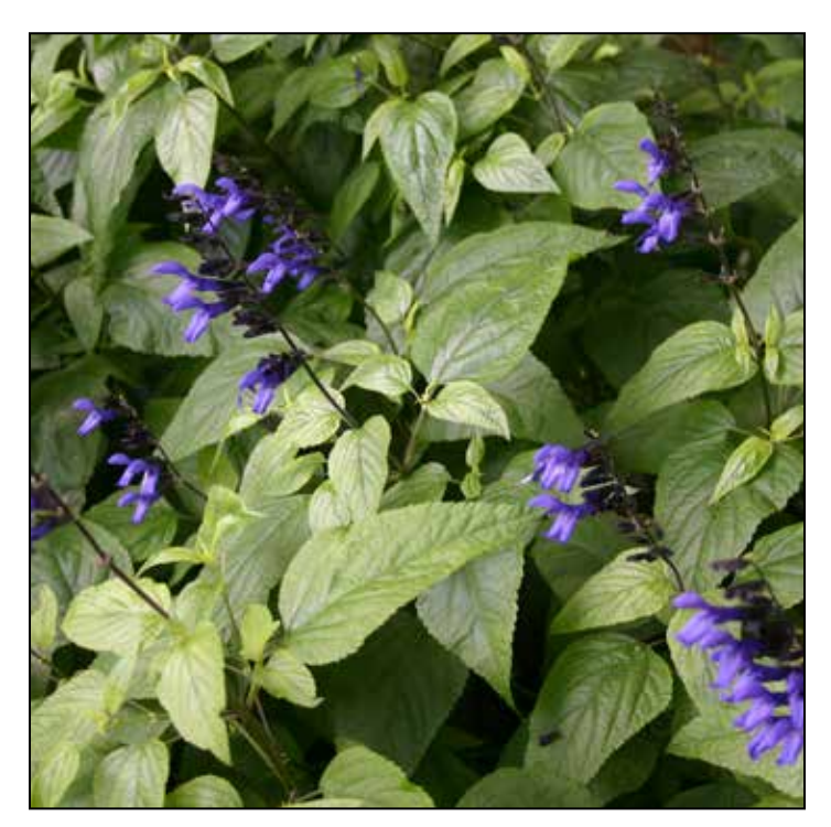
The shady areas of the Stone Wall Garden afforded a respite from the afternoon sun. Salvia guaranitica 'Black and Blue' provided a cooling effect.