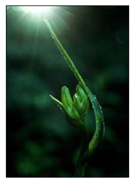
As each flower seeks the light, so we too share in the eternal light that illuminates the human heart.