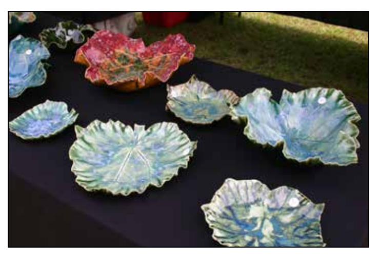
Among the many booths which had wares for sale, the ceramic exhibit was especially impressive.