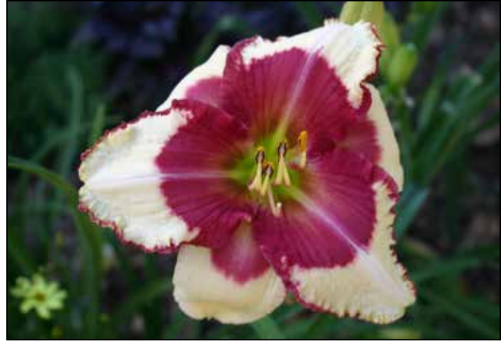
H. 'Mary Terrell' (George-J. 2013) which was in bloom the day of the tour is a lovely tribute to the lady whose garden has blessed so many. Bela Vista is widely recognized as one of the finest home gardens in all of Alabama.

As a gardener from lower Alabama, I truly enjoyed the peace of the hosta gardens. These plants provide not only beauty but also a cooling environment in our southern summer garden. Circling a tree on the patio and bordering this area of the garden, the hostas continue on to the back yard behind the garage. They are accompanied by other specimen plants including oak leaf hydrangeas, Japanese maples, heucheras, and ferns. Adding to the calm ambiance of the garden are a beautiful bottle tree and a very soothing "bubbling rock."