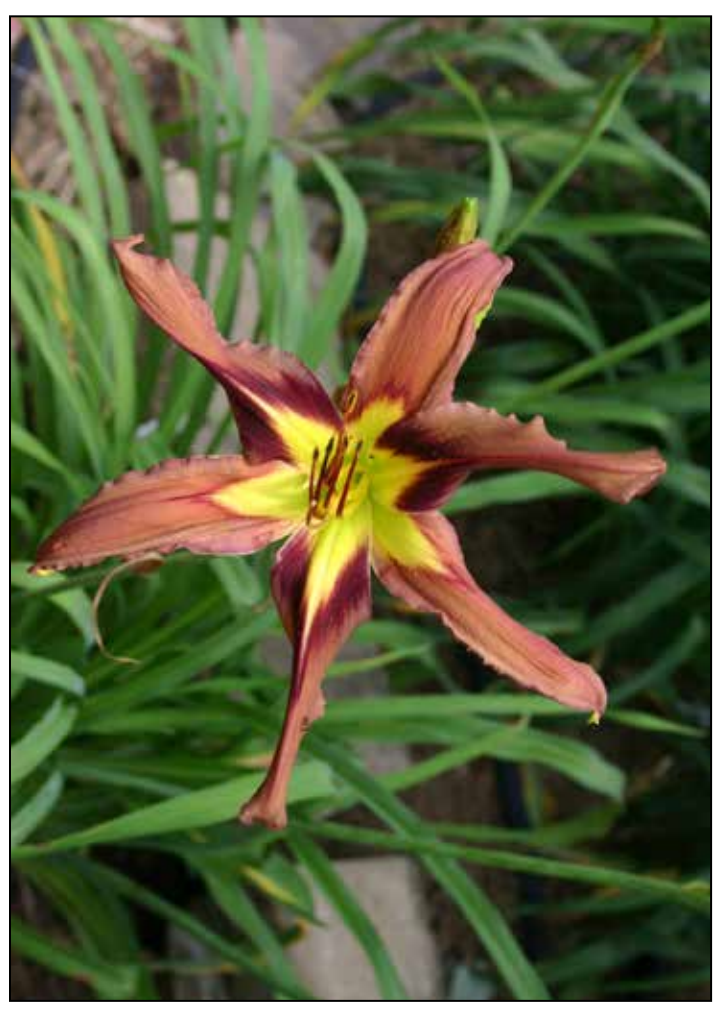
A daylily with which your editor was unfamiliar was H. 'Brown Exotica' (Gossard 2004), an unusual form crispate. It, too, attracted a lot of attention.

On the right side of the yard, a stone rock wall separated the Hooper's yard from their neighbor's yard. Daylily beds were terraced down from the wall, followed by columns, sitting spots, and steps also made of stone. As the yard sloped gently down, there were more beds made with colored retainer wall blocks and brick. Throughout the garden, I admired attractive pieces of garden art and various companion plants. I finally made my way to the left and rear of the property where there was a small garden shed, complimented by a gorgeous bottle tree on one side and a table set up on the other side with refreshments. To the left and rear of the shed were trees and a small stream. The shade of the trees and coolness of the stream provided much needed relief from the heat of the afternoon sun.