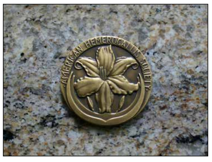
The American Hemerocallis Society's Regional Service Medal